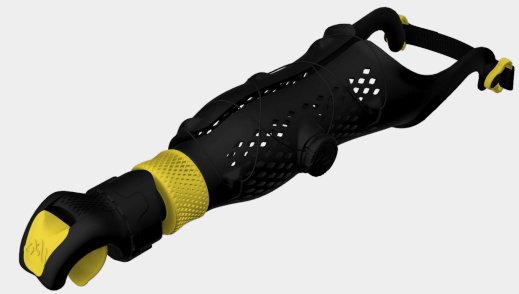
The Explorer with a Bike Grip Activity Hand printed in PA12